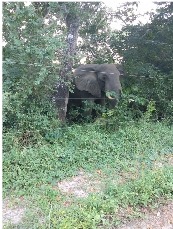
Elephant grazing close to the electric fence.