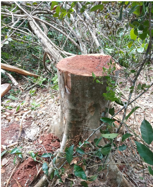
Mature Cynometra ( Cynometra webberi ), locally called Mufunda, destroyed in the forest.

In addition, KWS with support of FoASF realized 24 patrol days and supported maintenance of the fence.