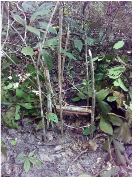
Trap for small rodents.