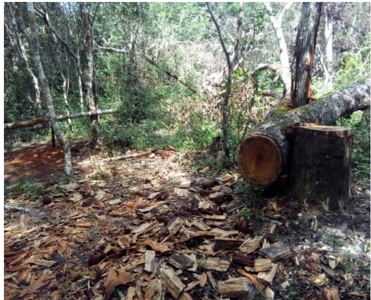
Mature hard wood tree ( Bragystegia speciformis ), locally called Mrihi , destroyed in the forest.