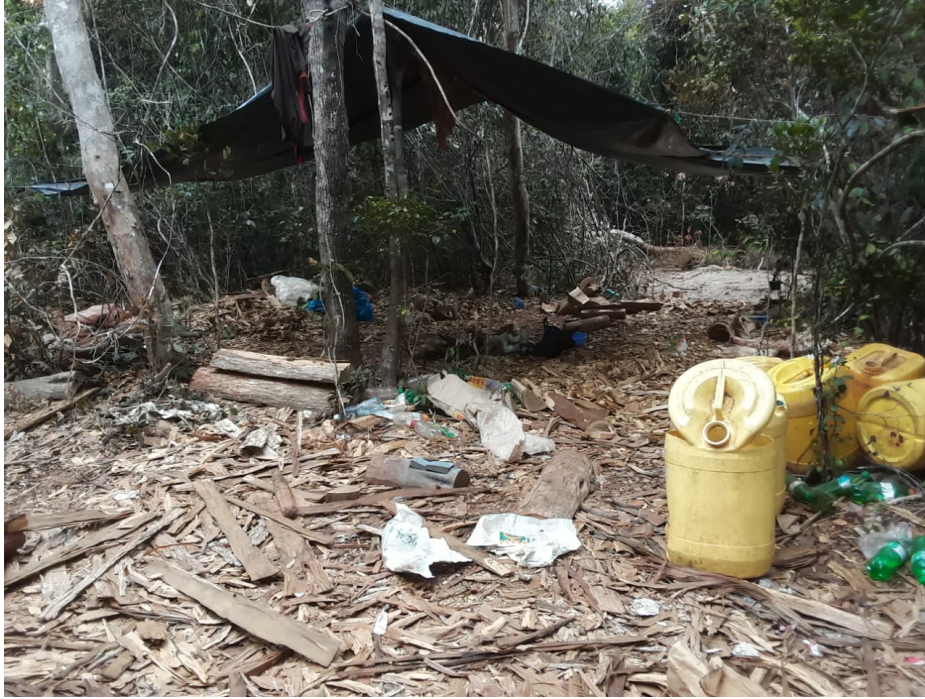
Active carving camp found during an ordinary patrol, showing continuous demand for hardwood and its products offered in carving industry.