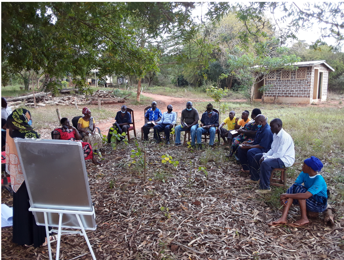
The new Sokoke Community Forest Association management committee and executive committee during a needs assessment session facilitated by Dzarino CBTO from Mtwapa.